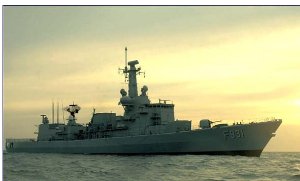
The Belgian frigate Louise Marie will shortly join the EU anti piracy patrol off Somalia

In June 2008, the United Nations Security Council approved incursions into Somali waters to combat the pirates. Consequently, a coalition of warships backed by aircraft began to patrol the Gulf of Aden in order to deter destabilising activities in the area, including drug smuggling, human trafficking and piracy. But despite the resolution and interventions by a coalition of warships, piracy has continued to climb. Six months ago, the European Union set up a joint naval patrol named 'Operation Atalanta' to act against piracy off the Somali coast. In August the Belgian frigate 'Louise Marie' will leave Zeebrugge to join the operation on 1 September.