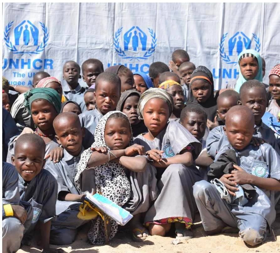
Children pose with their brand new school uniform outside their school Espoir, Dar Es Salam camp, in the Lake Chad province, Chad. The school welcomes Nigerian refugee children and children from host communities. Chad, January 2019