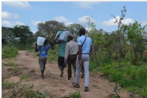
Community leaders and members assisting with carrying the drone to the Nintulo potential hydro site

Activities under this output are, according to the project document, planned to start in the third quarter after the start of project implementation, i.e. after the date of this report 12 . In the meantime, these activities have been included in the workplan as contained in the MONOP Q1 2019. An inventory of existing IT equipment and software in FUNAE has already started as a precursor to a full needs assessment and acquisition planning. An initial review of remote monitoring systems introduced under RERD1 and their suitability (- Victron Energy, - Belgian Campos, - EMS) has equally begun. These activities will intensify and accelerate with the arrival of the junior expert early March 2019.