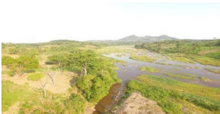
Investigating hydroelectricity potential using a drone in Zambezia province

RENEWABLE ENERGY FOR RURAL DEVELOPMENT PHASE 2 (RERD2) MOZAMBIQUE