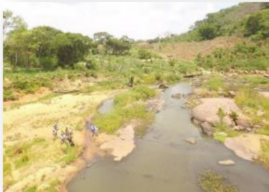
View from drone with curious youth assisting

Gender has been taken into account in the preparation of the work plan, notably in the activity ‘Implement a study on the post-electrification impact on rural communities in (north-central) Mozambique with special attention to gender through literature and field research if necessary / possible’ .