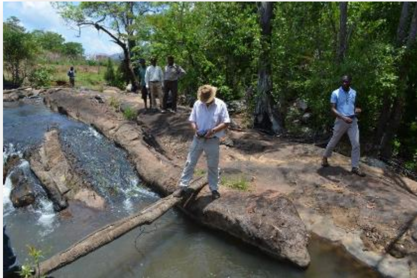
measuring water flow rate in Nintulo, Zambezia

As to 12 FUNAE identified potential RERD2 solar sites reconnaissance missions will commence in February 2019. The purpose of these is to prepare and submit - to the steering committee - a proposal for the selection of sites for prefeasibility and feasibility studies for investment in solar mini-grids in the case of a positive balance after cost projections of investment(s) in (a) hydroelectric plant(s).